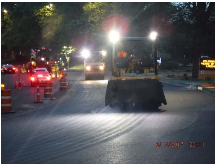
Placing new roadway pavement.