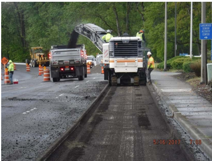
During construction, roadway pavement removal.