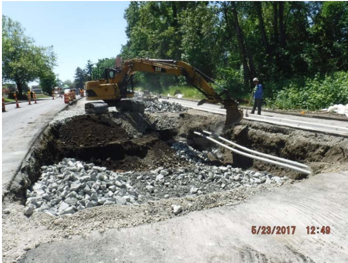
Removal of unsuitable material and stumps, found during construction