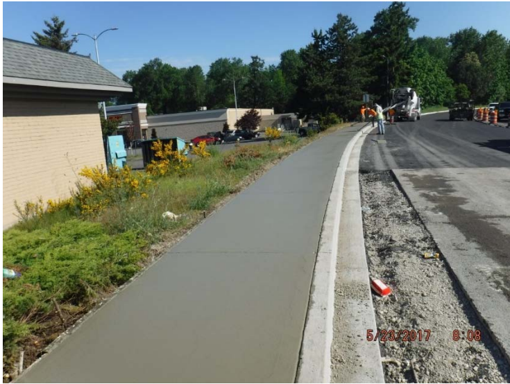
Placement of new sidewalk.