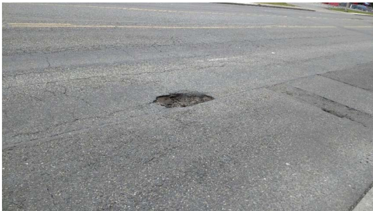
Before: Roadway patching and potholes.