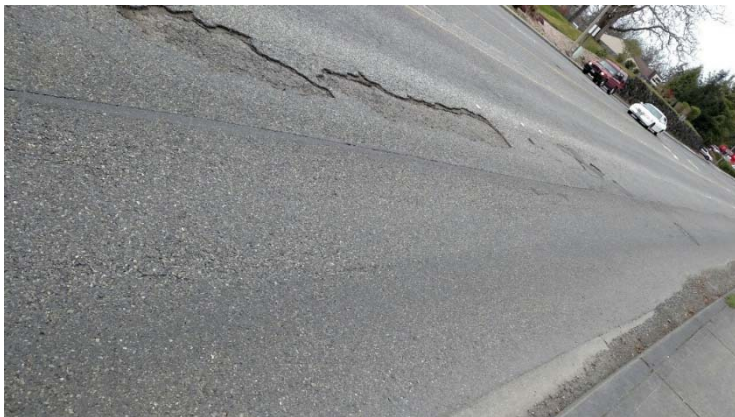
Before: Roadway delamination over wheel path fatigue cracked areas.