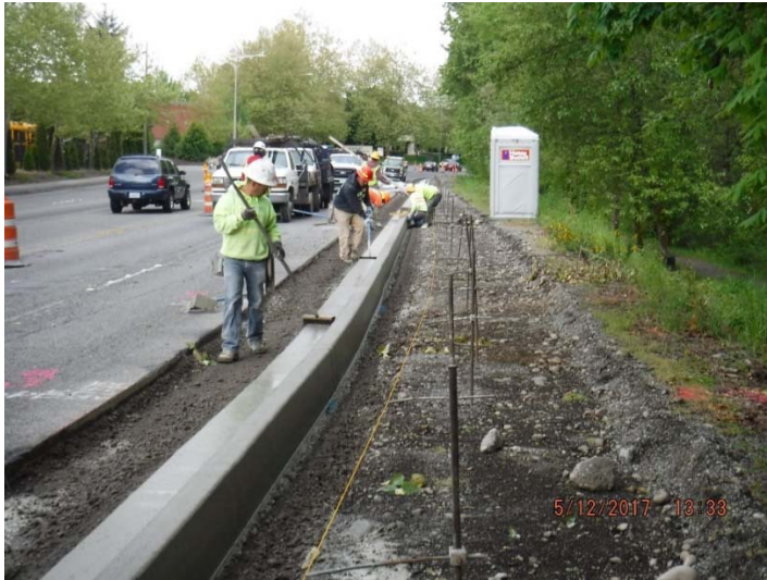
New curb and gutter, Seeley Lake side of Lakewood Dr.