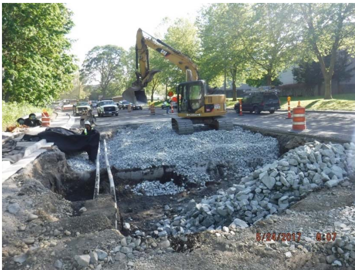
Removal of unsuitable material and stumps and necessary repair, resulting in additional project costs.