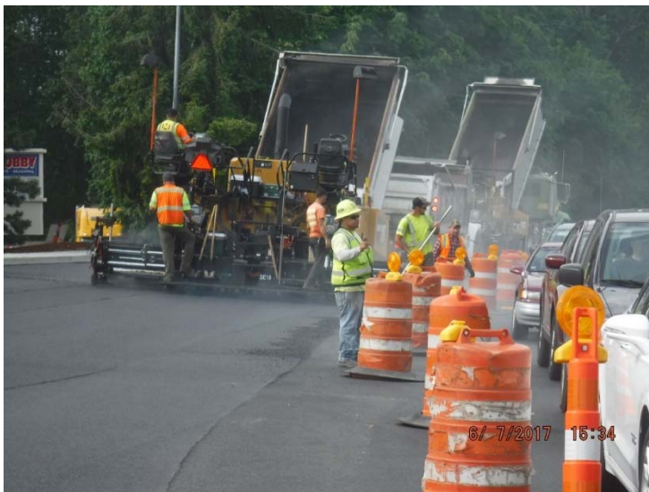
Placing new roadway pavement.