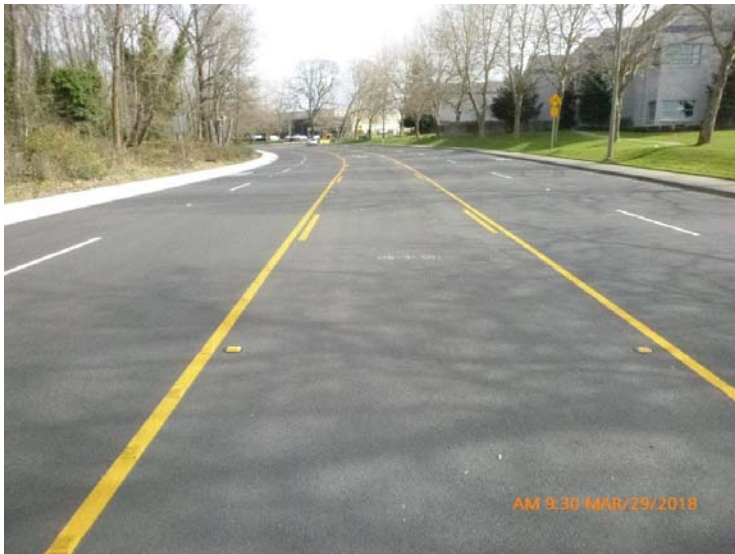
Final striping after 9 months in use.