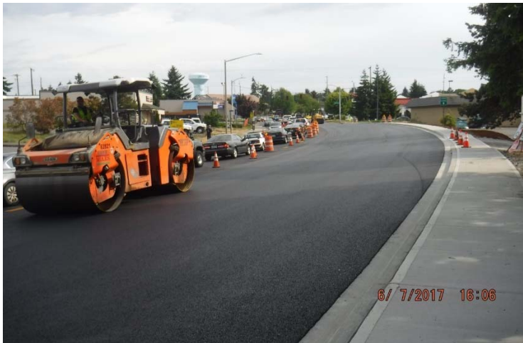
After paving with new sidewalk.