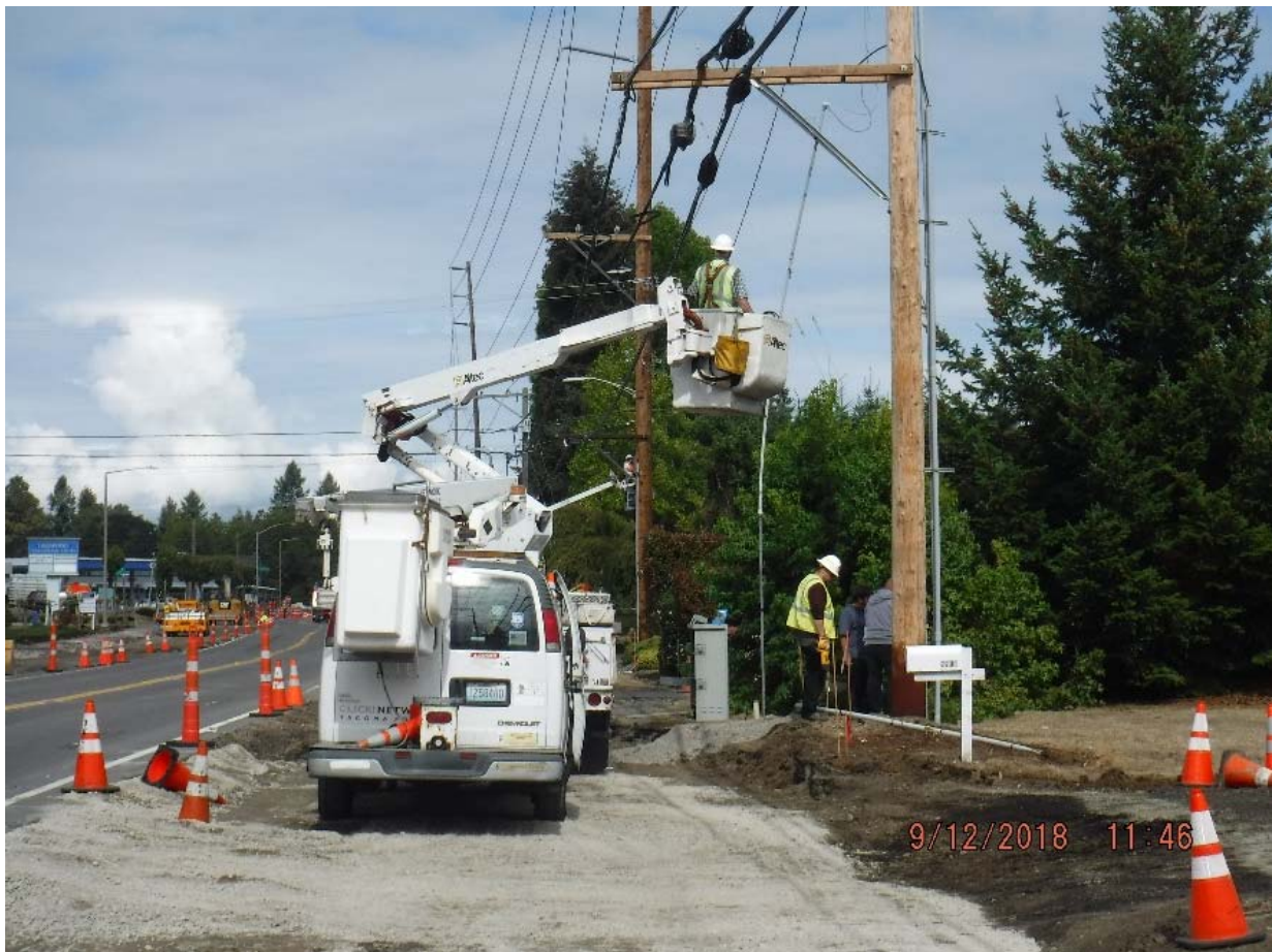
During Construction: utility relocation to accommodate improvements.