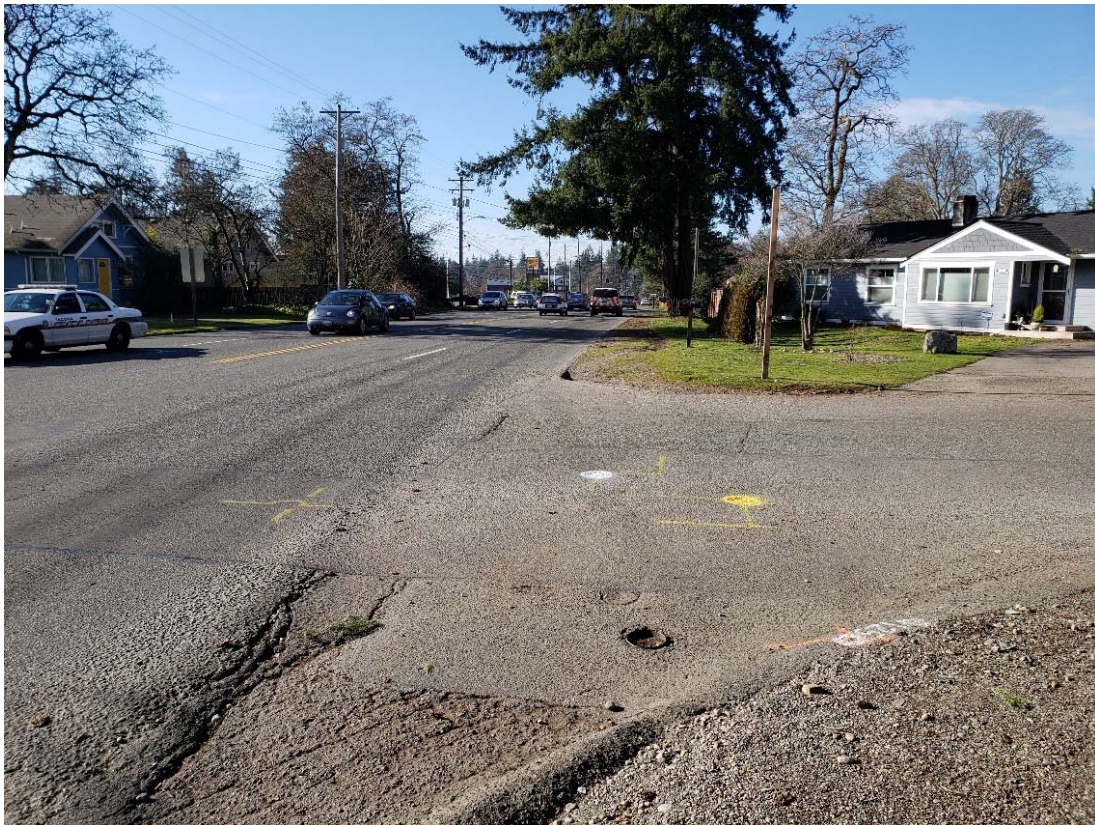
Existing Condition: showing need for overlay, curb and gutter, and sidewalk. (88 th St. looking west on the north side of the road between Custer Rd. and Steilacoom Blvd.)