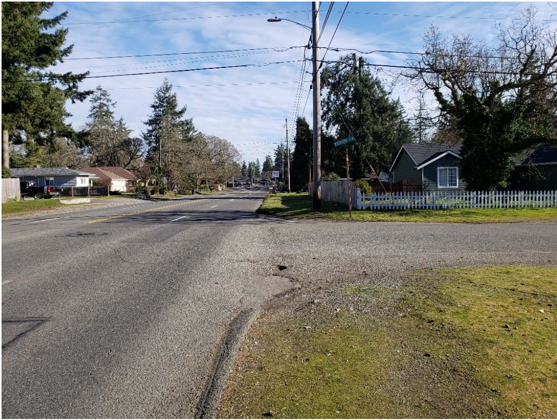
Existing Condition: showing need for overlay, curb and gutter, and sidewalk. (88 th St. looking east on the south side of the road between Steilacoom Blvd. and Custer Rd.)