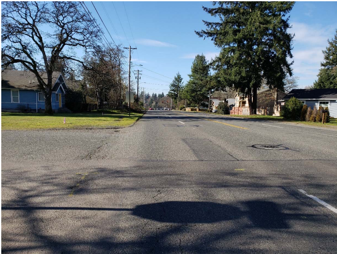
Existing Condition: showing need for overlay, curb and gutter, and sidewalk. (88 th St. looking west on the south side of the road between Custer Rd. and Steilacoom Blvd.)