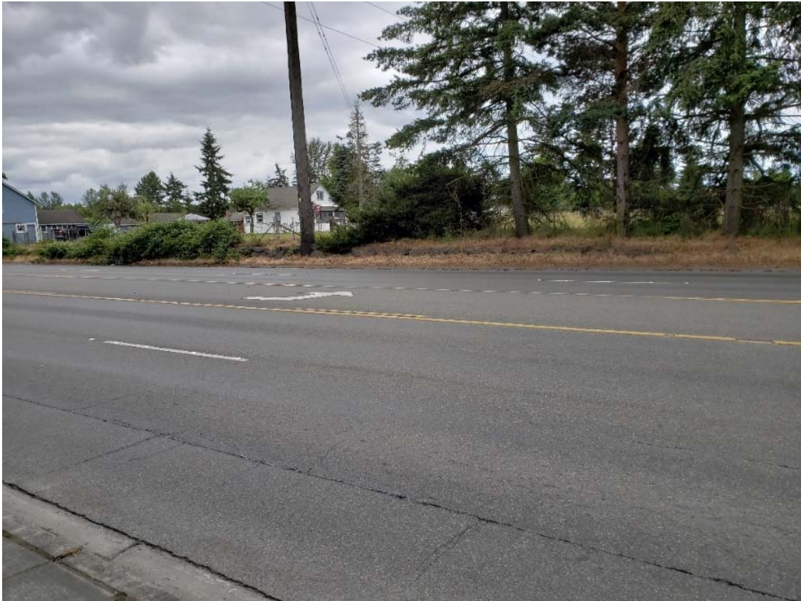
Before showing roadway cracking and the need for full depth pavement replacement including the need for curb and gutter, and sidewalk on the west side of the roadway.