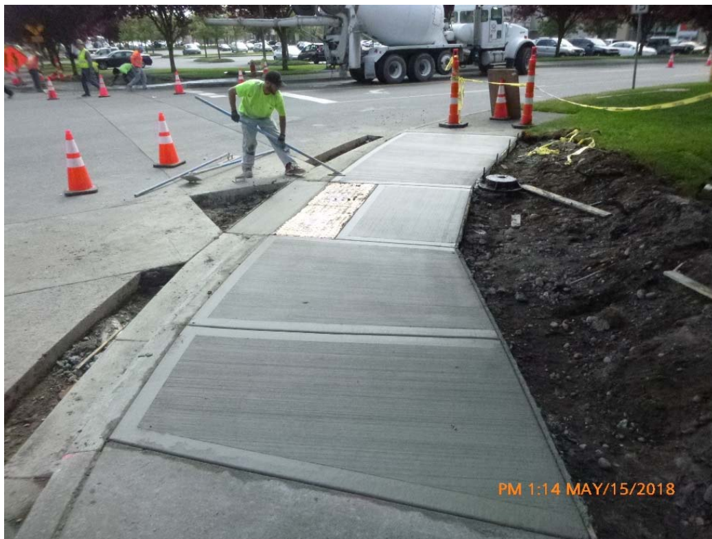
Upgrade of existing pedestrian facilities to meet ADA requirements.

The overlay work was done very quickly, with the Council award on April 16, 2018 and completion was issued June 29, 2018. This was a very successful project, with minimal impact to the residents and businesses in the Towne Center. 59 th Ave. will provide good service for many years to come and it meets current ADA requirements.