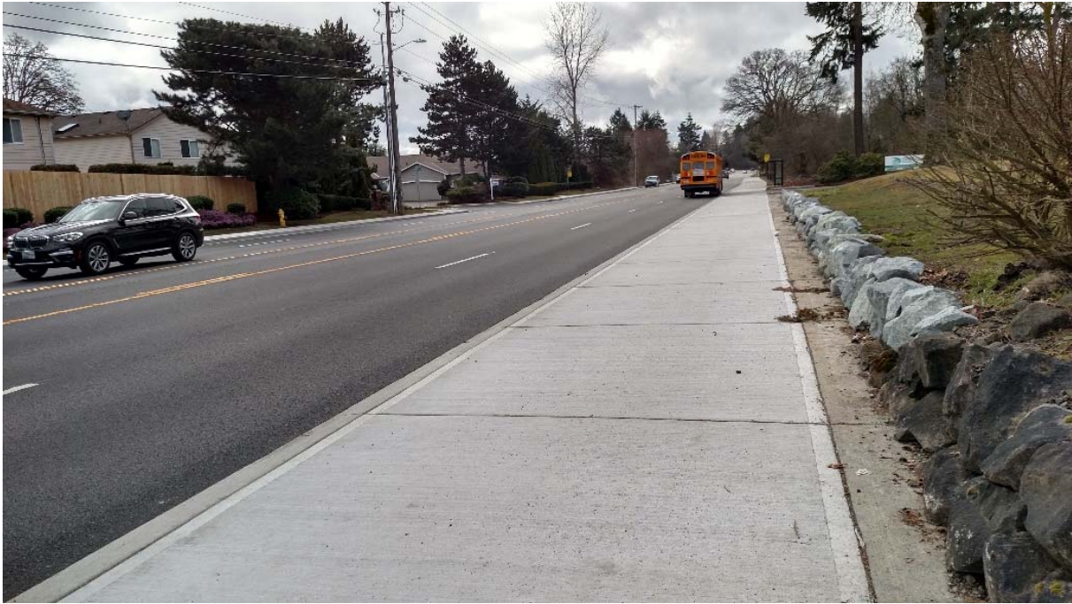
After condition of Lakewood Drive looking south, nine foot sidewalk.