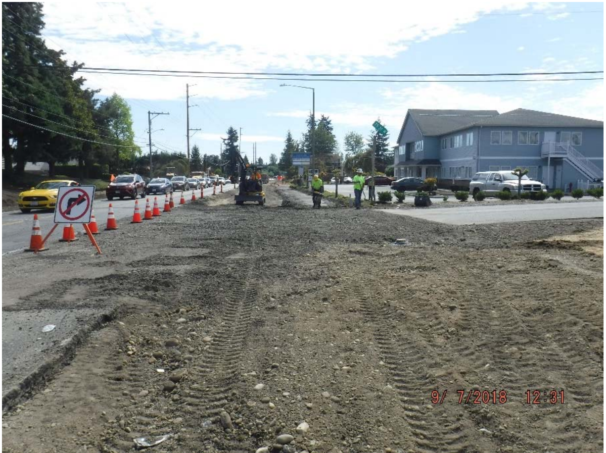
During Construction: roadway removal and replacement, preparing grade for new sidewalk.