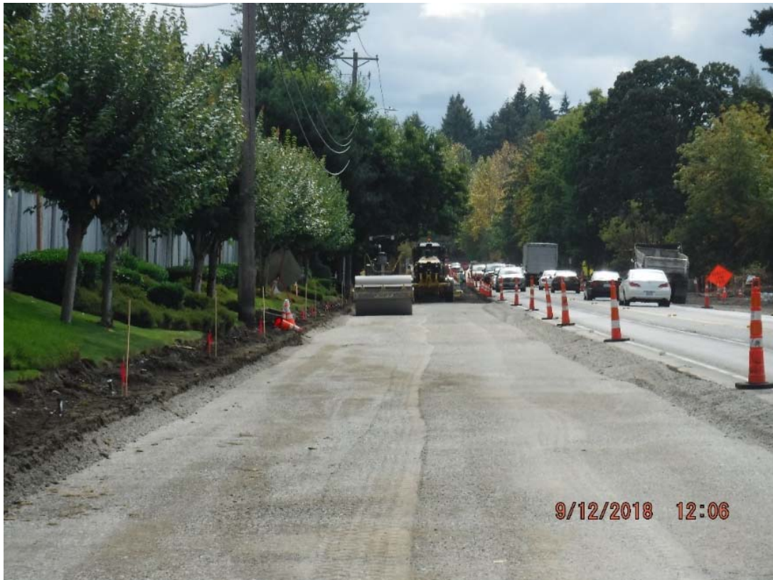
During Construction: subgrade preparation ahead of new sidewalk and pavement.