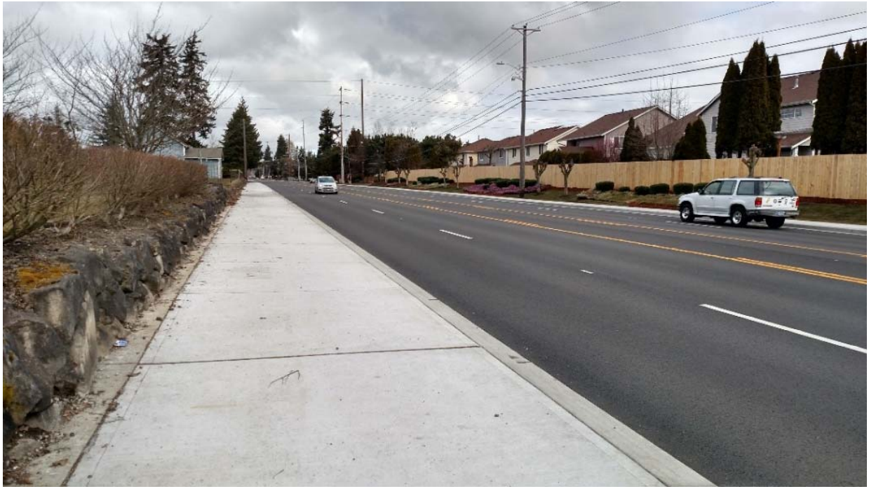
After condition of Lakewood Drive looking north, nine foot sidewalk.