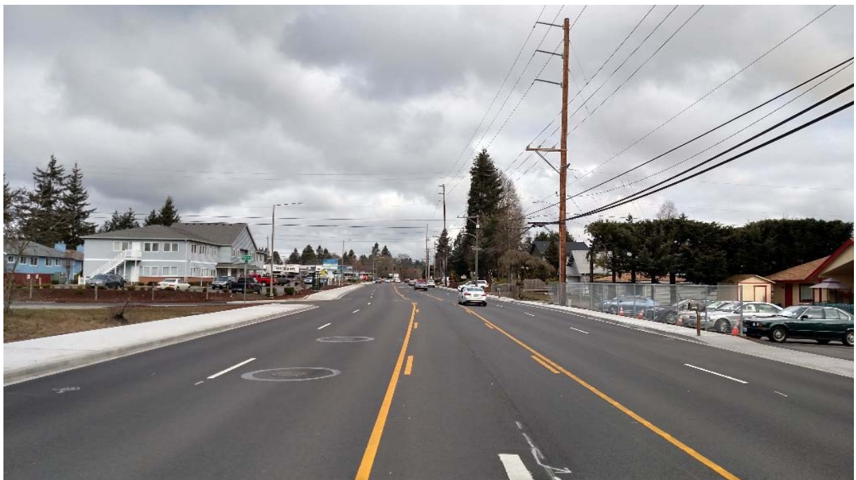
After condition of Lakewood Drive looking north, nine foot sidewalk.