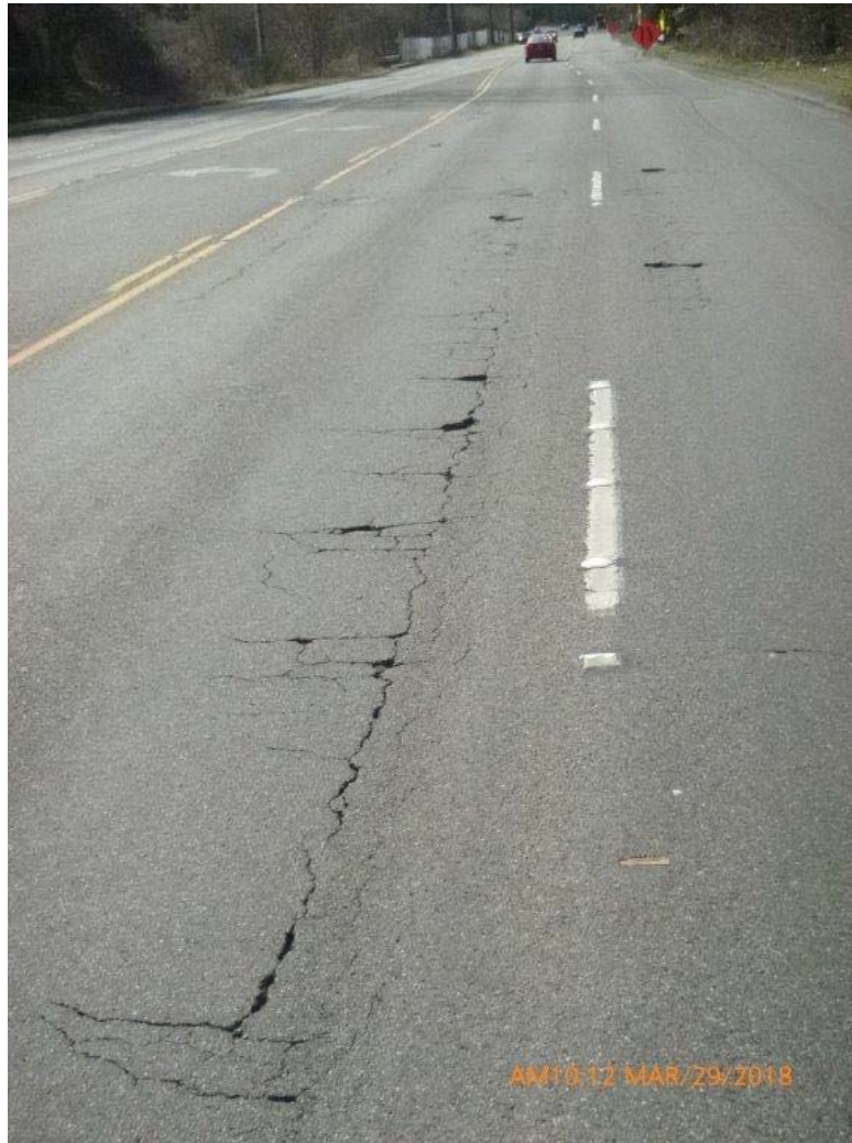
Before condition of Lakewood Drive, full depth pavement failure in wheel paths.