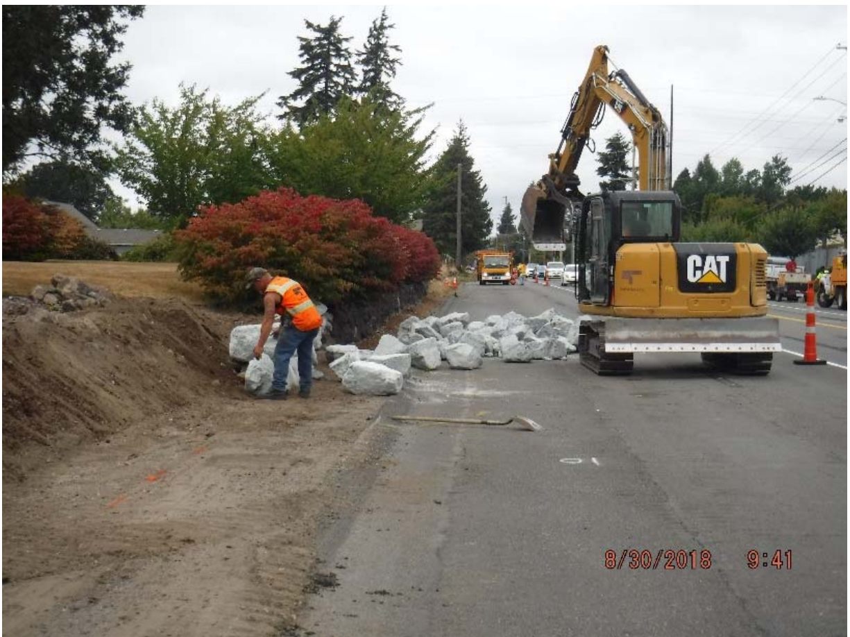
During Construction: Wall construction to accommodate new sidewalk.