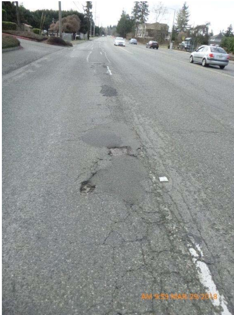
Before condition of Lakewood Drive, full depth pavement failure and roadway patching.