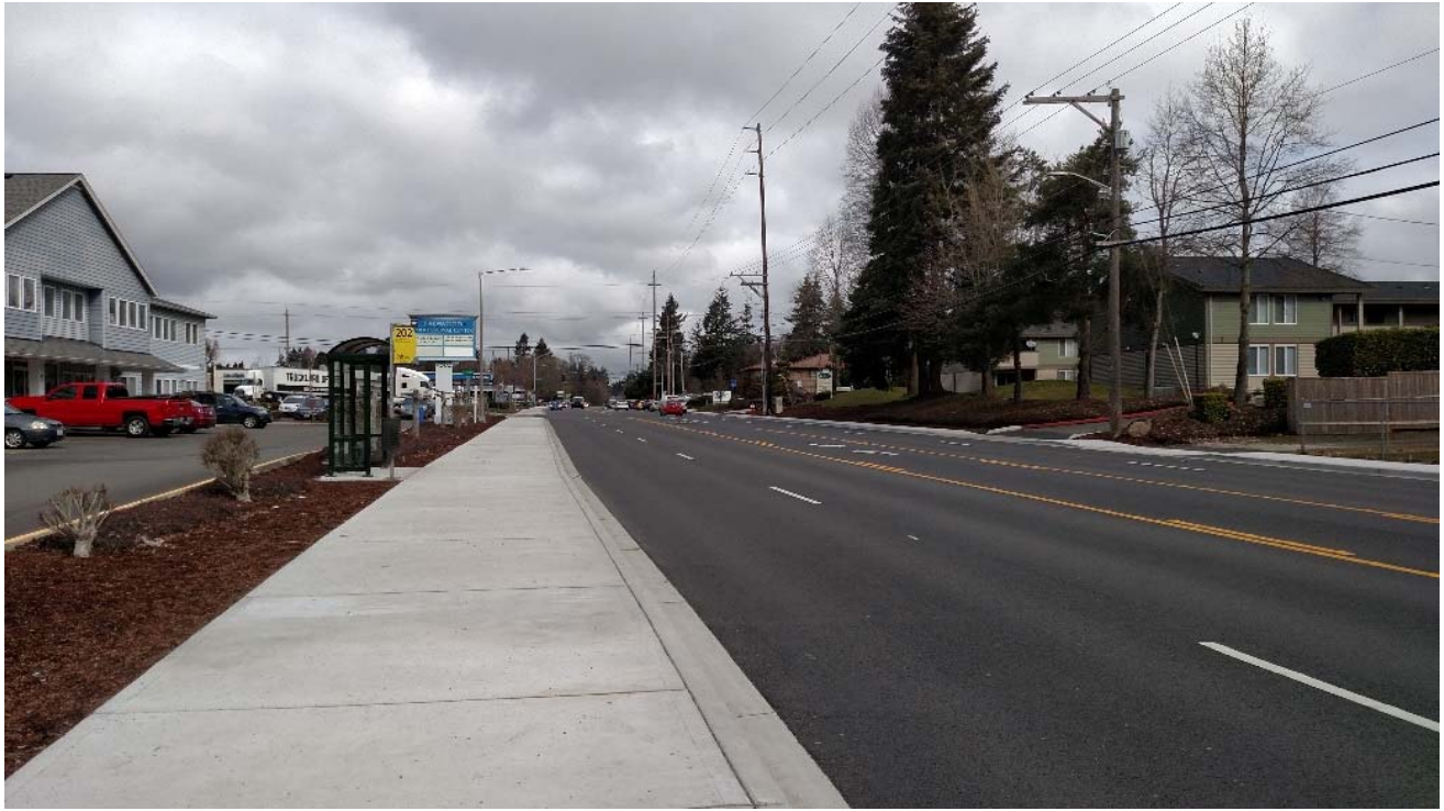
After condition of Lakewood Drive looking north, nine foot sidewalk.