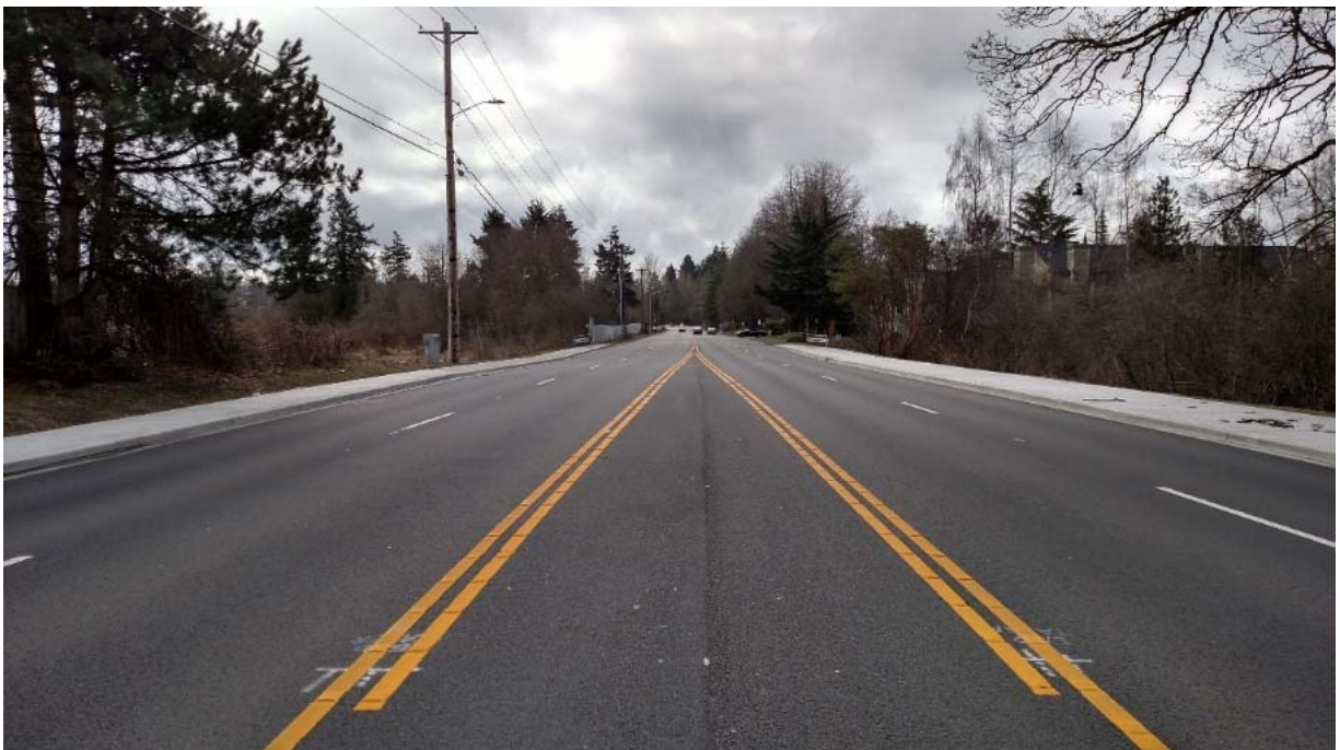
After condition of Lakewood Drive looking south toward Flett Creek.