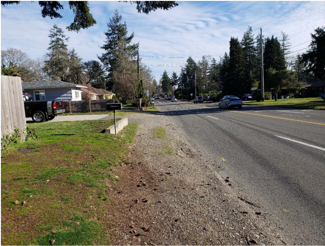
Existing Condition: showing need for overlay, curb and gutter, and sidewalk. (88 th St. looking east on the north side of the road between Steilacoom Blvd. and Custer Rd.)