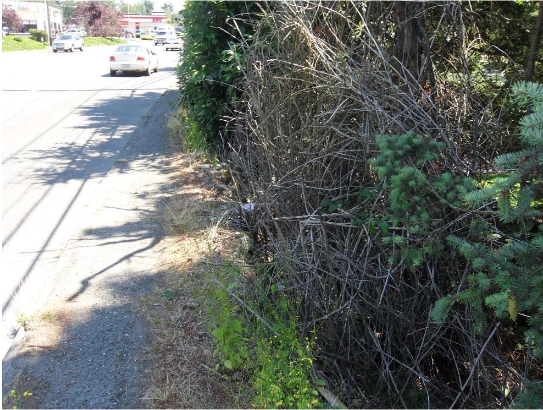
Existing Condition: showing need for overlay, curb and gutter, and sidewalk. (Steilacoom Blvd. looking east on the south side of the road between Phillips Rd. and Weller Rd.)