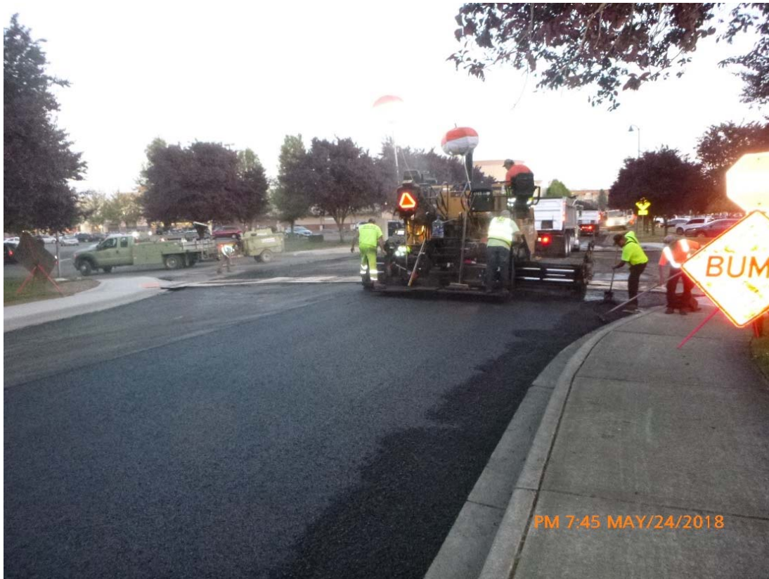
Roadway grinding and Hot Mix asphalt overlay of the existing roadway.