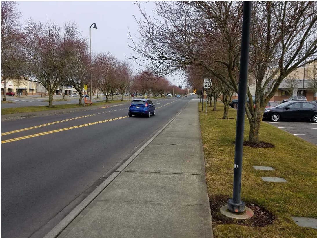
After condition of 59 th Ave. looking north, 10 months after pavement overlay completion.