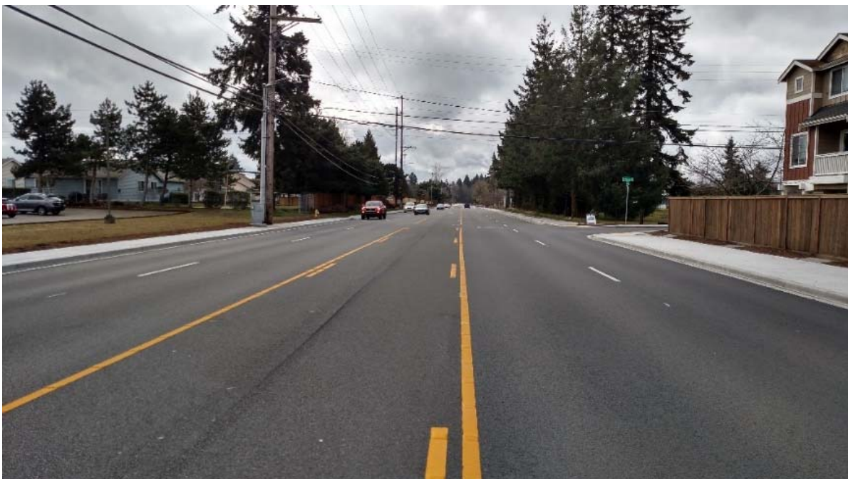
After condition of Lakewood Drive looking south.