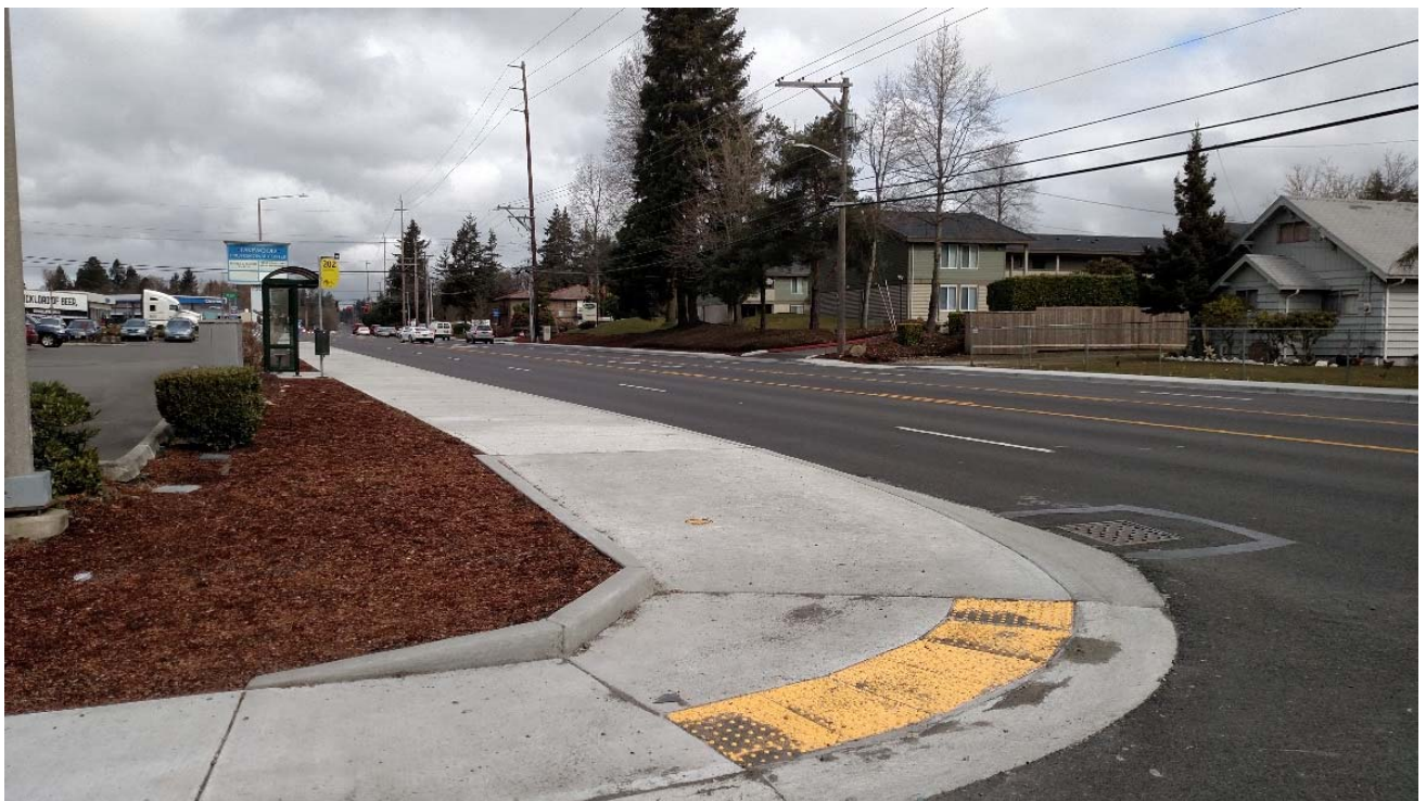
After condition of Lakewood Drive looking north, nine foot sidewalk.