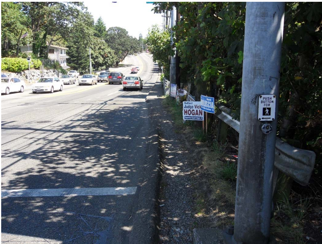
Existing Condition: showing need for overlay, curb and gutter, and sidewalk. (Steilacoom Blvd. looking east on the south side of the road between Phillips Rd. and 88 th St.)