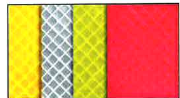
Other reflective Super Bright™ sign colors: Yellow, White, Lime, Pink