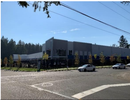
Lakewood Logistics Center V (Black Creek Group)