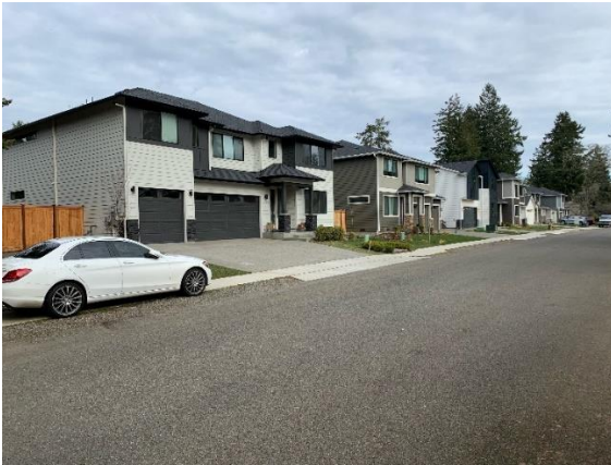
Northridge Development in Oakbrook

Notable completed housing for 2022 includes Washington Blvd Apartments – 42 units, and the Northridge housing development in Oakbrook – 15 units SFR.