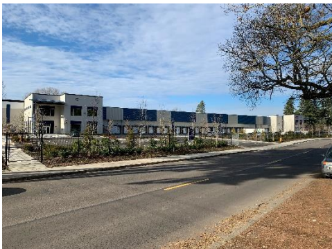
American Lake Logistics