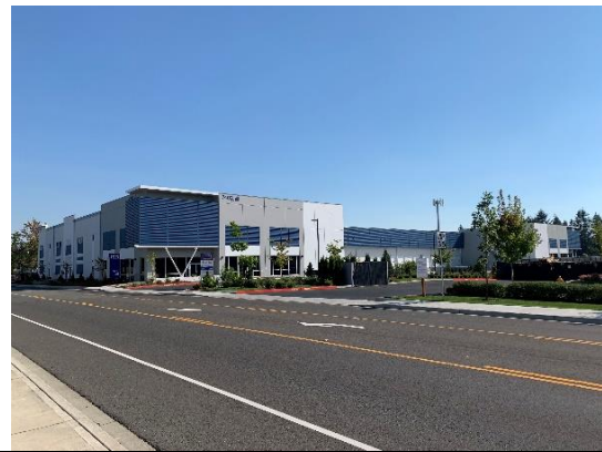
Bridge Point Lakewood 90