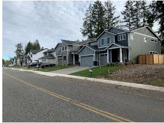
Washington Blvd Apartments