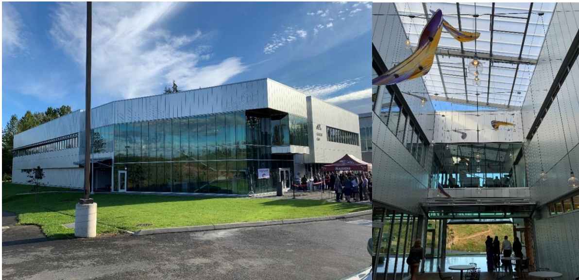
Pierce College Glacier Building

Pierce College has completed construction on the Glacier Building. Glacier will provide state-of-the-art learning space for dental hygiene and veterinary technology programs.