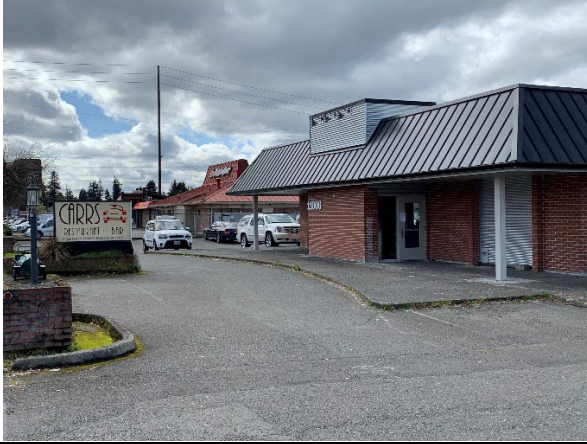
Carrs Restaurant Interior and Exterior updates