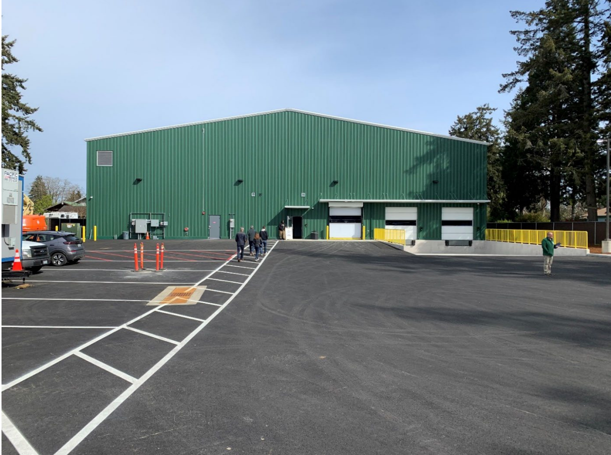
Emergency Food Network New 21,600 sf food storage warehouse