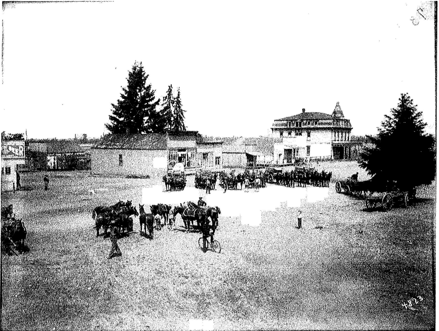
LAKEVIEW AVE 1904, HOTEL & STORE FRONTS WASH NATIONAL GUARD TROOPS