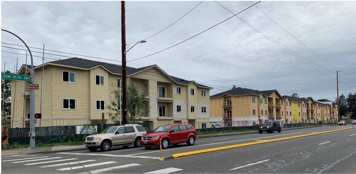
Heron Heights Apartments New Apartment Buildings (36 units)