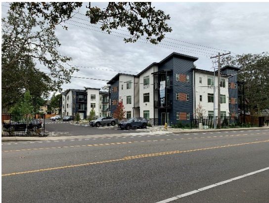
Heron Heights Apartments New Apartment Buildings (36 units)